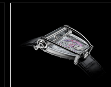
HM8 ONLY WATCH PROFILE