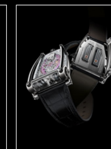
HM8 ONLY WATCH