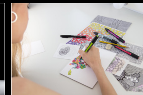
CASSANDRA LEGENDRE DRAWING