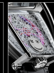
HM8 ONLY WATCH CLOSE-UP