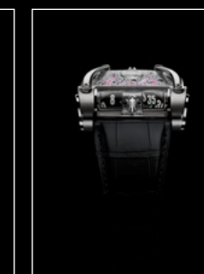
HM8 ONLY WATCH FACE