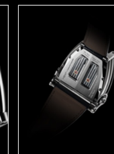
HM8 ONLY WATCH BACK