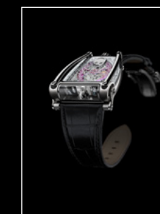
HM8 ONLY WATCH FRONT