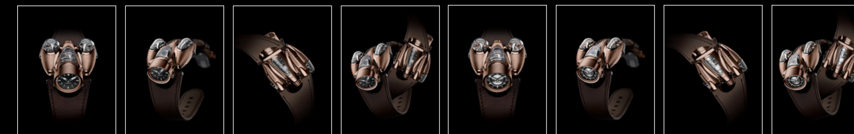
HM9 Flow Red Gold Air Edition, HM9 Flow Red Gold Air Edition, HM9 Flow Red Gold Air Edition, HM9 Flow Red Gold Air Edition, HM9 Flow Red Gold Road Edition, HM9 Flow Red Gold Road Edition, HM9 Flow Red Gold Road Edition, HM9 Flow Red Gold Road Edition