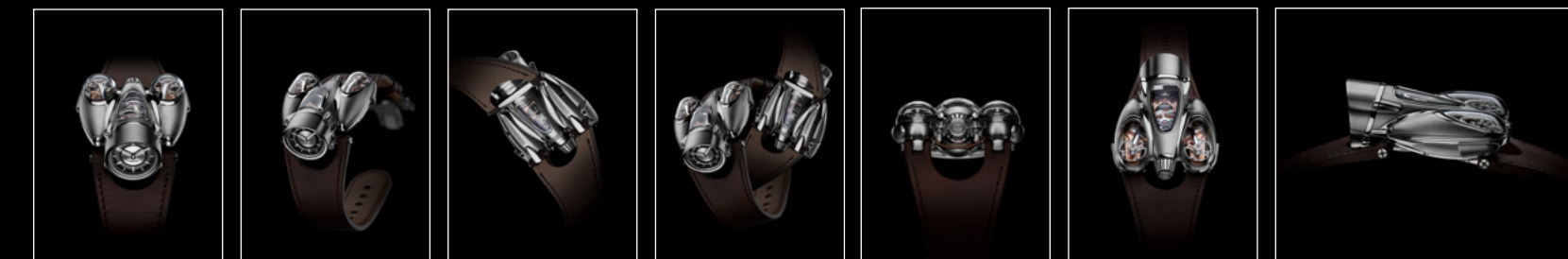
HM9 Flow Titanium Road Edition, HM9 Flow Titanium Road Edition, HM9 Flow Titanium Road Edition, HM9 Flow Titanium Road Edition, HM9 Flow Titanium Road Edition, HM9 Flow Titanium Road Edition, HM9 Flow Titanium Road Edition