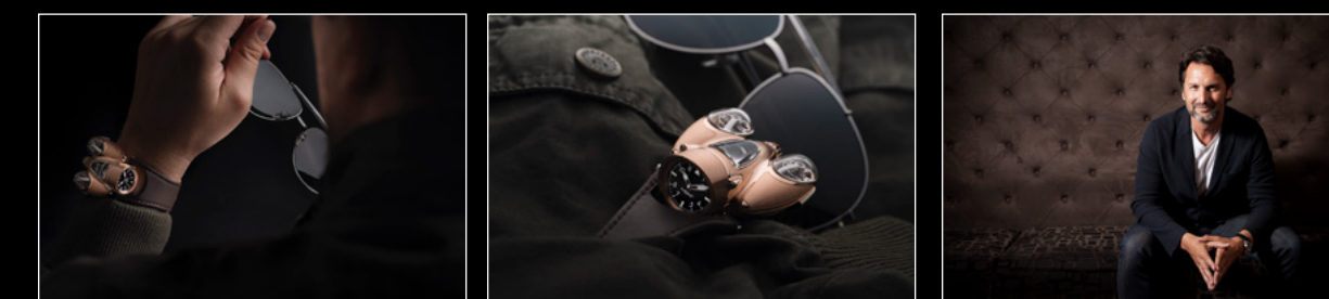
HM9 Flow Red Gold 'Air Edition' Lifestyle, HM9 Flow Red Gold 'Air Edition' In-situ, MAXIMILIAN BÜSSER PORTRAIT