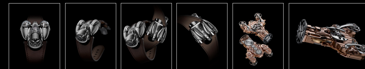
HM9 Flow Titanium Air Edition, HM9 Flow Titanium Air Edition, HM9 Flow Titanium Air Edition, HM9 Flow Titanium Air Edition, HM9 Flow Titanium Engine 01, HM9 Flow Titanium Engine 02