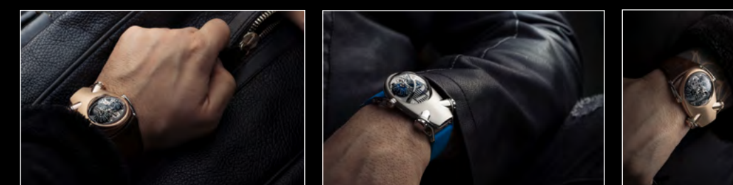
HM10 BULLDOG RG WRISTSHOT | HM10 BULLDOG TI WRISTSHOT | HM10 BULLDOG RG WRISTSHOT