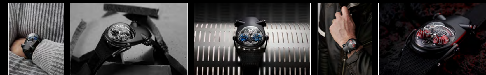
HM10 DARK BULLDOG BLUE WRISTSHOT | HM10 DARK BULLDOG BLACK LIFESTYLE | HM10 DARK BULLDOG BLUE LIFESTYLE | HM10 DARK BULLDOG RED WRISTSHOT | HM10 DARK BULLDOG RED LIFESTYLE