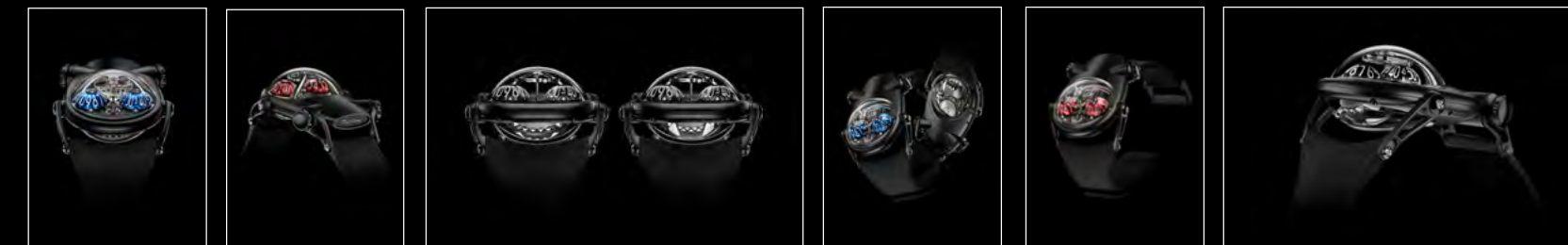
HM10 DARK BULLDOG BLUE FACE | HM10 DARK BULLDOG RED REAR | HM10 DARK BULLDOG BLACK OPEN/CLOSED | HM10 DARK BULLDOG BLUE | HM10 DARK BULLDOG RED FRONT | HM10 DARK BULLDOG BLACK PROFILE