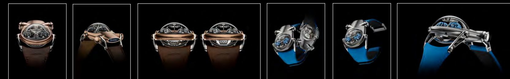
HM10 BULLDOG RG FACE | HM10 BULLDOG RG REAR | HM10 BULLDOG RG OPEN/CLOSED | HM10 BULLDOG TI | HM10 BULLDOG TI FRONT | HM10 BULLDOG TI PROFILE