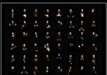
HM10 BULLDOG FRIENDS LANDSCAPE